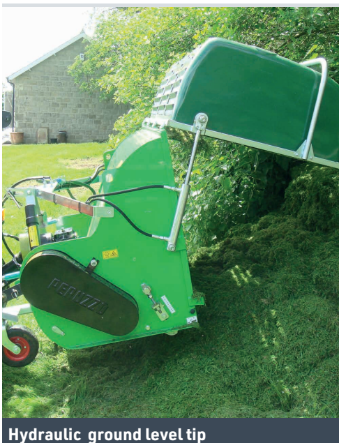
Hydraulic ground level ti on all 'C' models